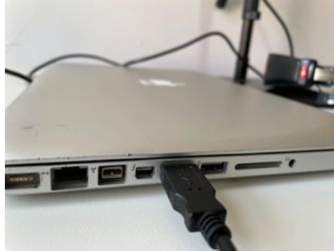
Plug the audio interface USB into the computer