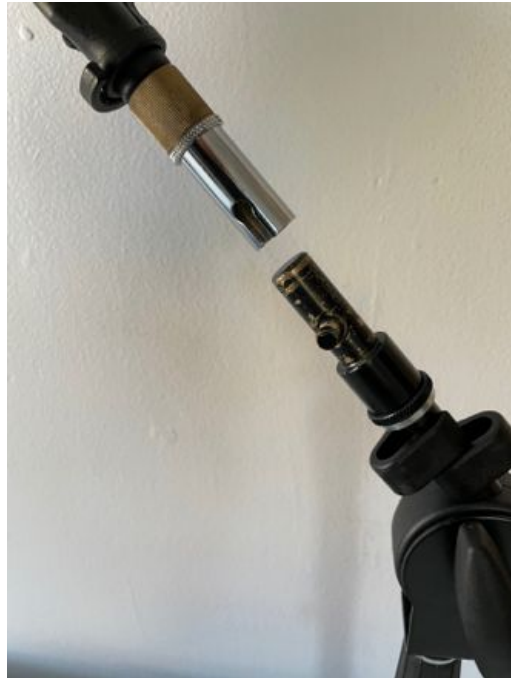
Attach the microphone to the microphone stand.