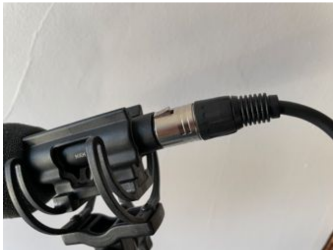
Plug in the microphone (XLR) cable into the back of the microphone